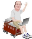
Georgia Closing Coordinator